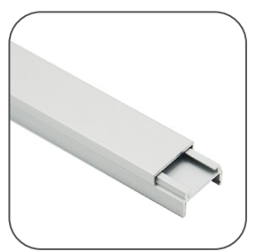
Alu Profile (Back)